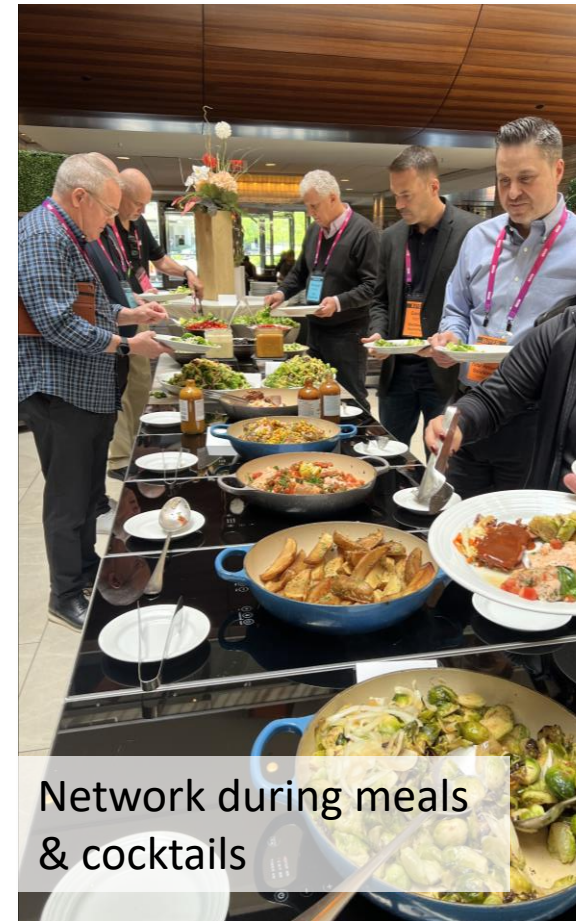
Network during meals & cocktails