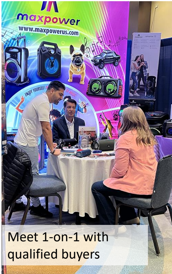
Meet 1-on-1 with qualified buyers