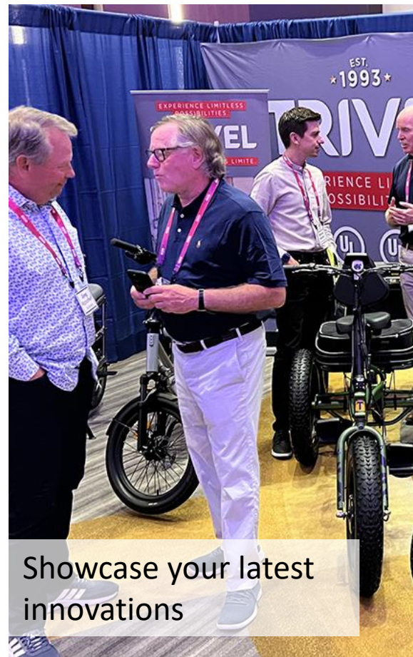
Showcase your latest innovations